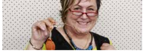
WEAVE workshop during Wominjeka 2013.