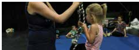
Toddler Circus workshop

Our young animators won best child-made film in the Little Big Shots International Film Festival for Kids for 'Tales of a Refugee' .