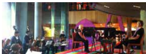
The Amplified Elephants perform Shimmersong at the NGV.