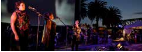
The Black Arm Band perform dirtsong as part of Wominjeka 2013.