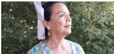
Choreographer's Appointment.