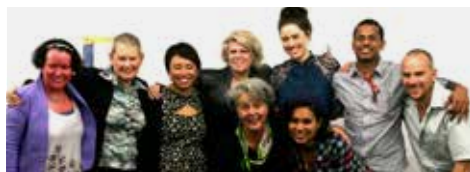
Participants of the FilmLife project at the screening evening

We delivered three action-packed days each school holidays exploring a range of artforms including animation, circus, digital arts, drama, puppetry, music, sculpture and visual arts.