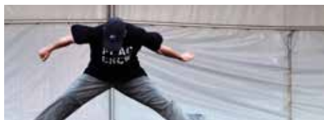
ArtLife performed at Big West as part of Dance Republic.