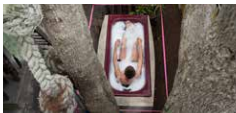
Photograph from My Sacred Place . Image by Pia Zanetti.