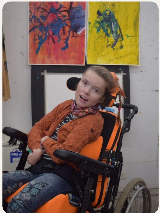
Backcover artwork Field of Sunflowers 2023